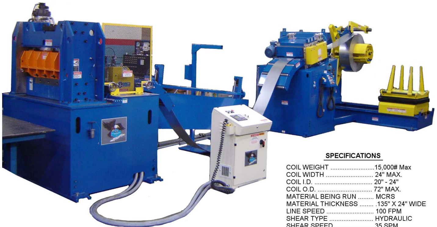
24" wide x 15,000# CTL w/ Hydraulic Production Shear